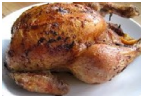
Roast Suffolk chicken, sage & onion stuffing

All served with Yorkshire pudding, roast potatoes, seasonal vegetables & roast gravy